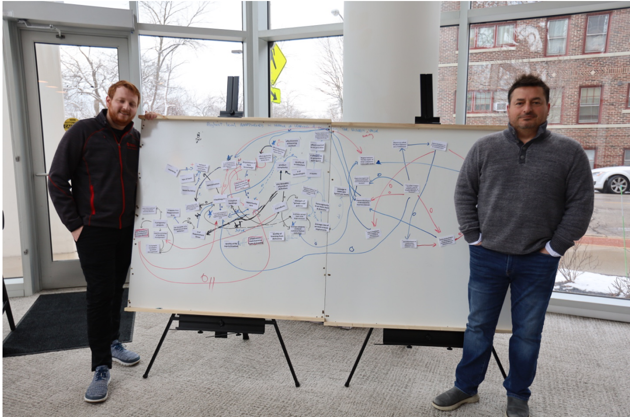
Figure 1: Here is an older example of two large artist easels setup for class. The design specifics have changed, yet the overall size and footprint required are the same if only using two panels per participant table.