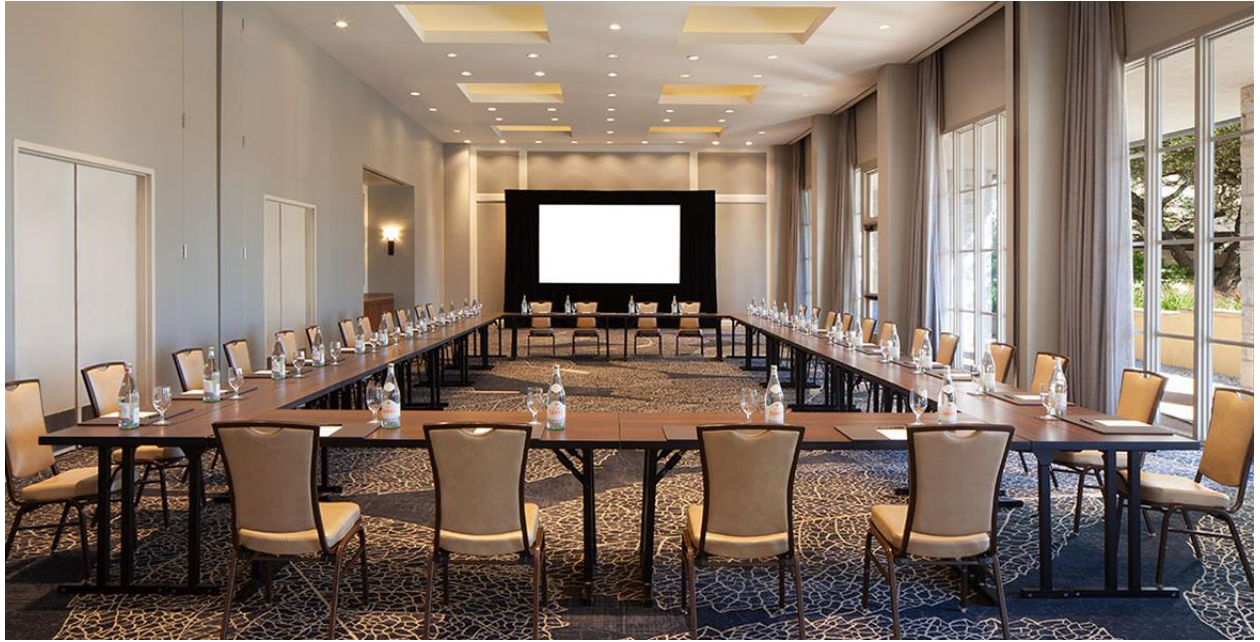
Figure 3: Photo of the Barton Creek AB meeting room at the Omni Barton Creek in Austin. Although seemingly large enough to easily fit 30 students, the layout diagram in the next figure shows just how much of this space is consumed by easels and whiteboards. Please ignore the inappropriate table layout shown in this photo.